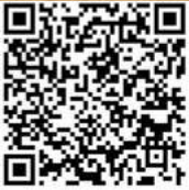
Dads 'N' Lads

October 26th - November 24th Dubai will be supporting Dubai 30x30, and coinciding with MOvement, we aim to support both wonderful awareness campaigns Click or Scan the QR Codes for activities and sign up forms.