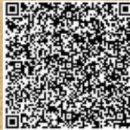
Dubai 30x30 Calendar