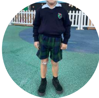
Fully compliant uniform

A gentle reminder that in these colder months, jumpers should be official school jumpers. However, we understand at times as we head toward different parts of a year, this may affect purchasing decisions. If you choose to wait, please use alternative clothing that aligns with our color scheme (dark blue jumper as shown below). Additionally, for safety and neatness, students with long hair should have it tied back, shoes should be majority black when worn with the school uniform and appropriate sports trainers with the PE uniform (not fashion trainers). If you have any questions then please speak with your child's teacher. Also keep your eyes open for the next second hand uniform sale.