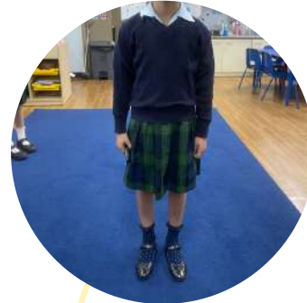
Acceptable example of a non DIA jumper