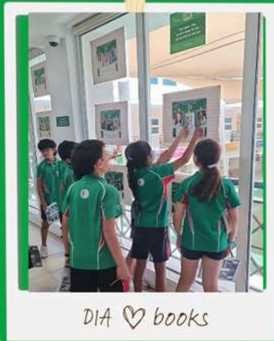
DIA ♡ books