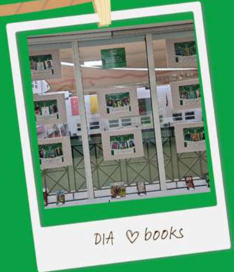
DIA ♡ books

And the lucky WINNERS of some BOOKTASTIC prizes from over 600 entries in the RAFFLE of DIA ♡ BOOKS EXHIBITION are: