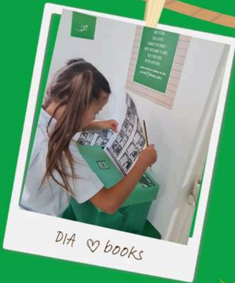
DIA ♡ books