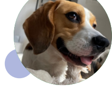
A cheeky smirk from the pup himself