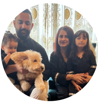
Meet Alisah's fur sibling, Milo, who 'loves' sitting for family picture time!