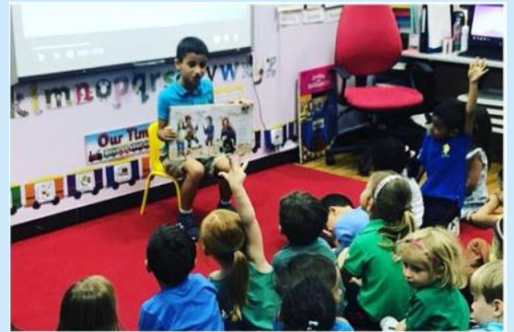
We celebrated Earth Day with a number of fun activities. Our PSC took action and read to classes.