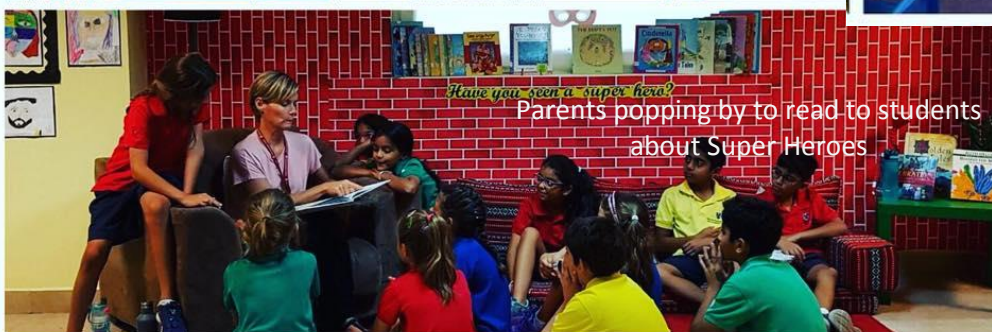
Parents popping by to read to students about Super Heroes