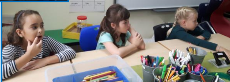
Year 2 students listening to the story