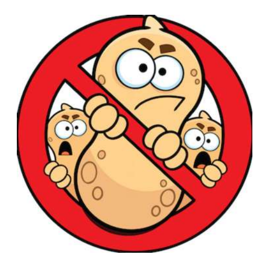
The school has several children that have severe nut allergies. Please do not send foods that contain nuts into school.