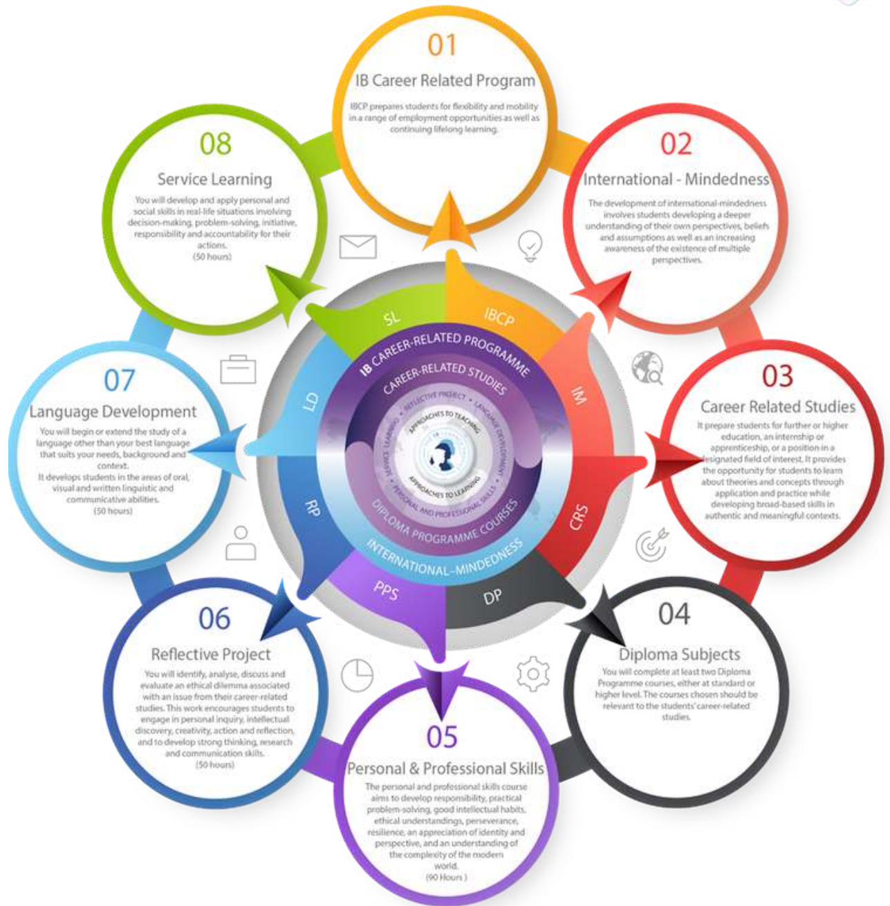
Model of the Career-related Programme