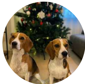
Guess what time it is in our house this weekend (photo from last year).