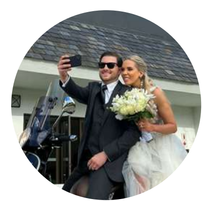
The Happy Couple