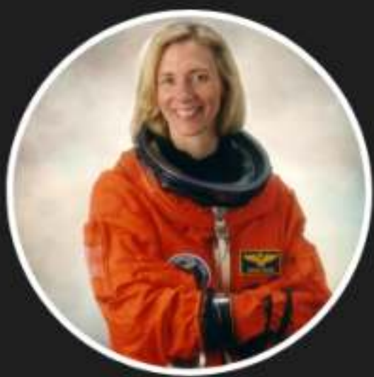
CDR SUSAN KILRAIN NASA Astronaut